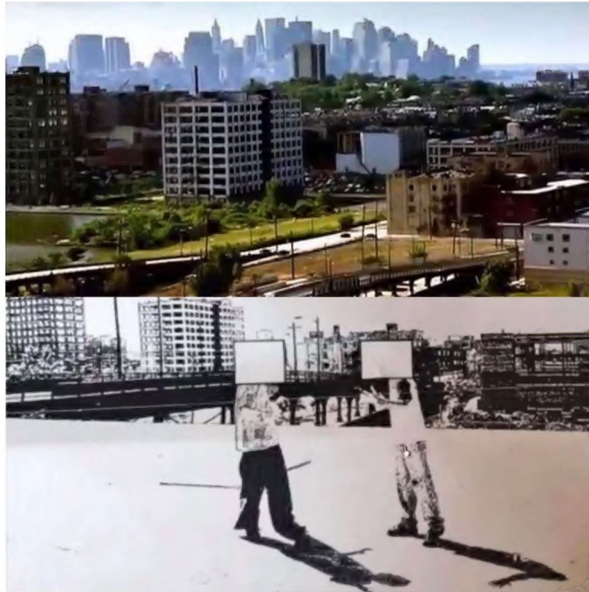
A high-quality photo, top, shows the area the dancing Israelis were staged.

For years, the official story has been that these individuals, while they had engaged in “immature” behavior by celebrating and being “visibly happy” in their documenting of the attacks, had no prior knowledge of the attack. However, newly released FBI copies of the photos taken by the five Israelis strongly suggest that these individuals had prior knowledge of the attacks on the World Trade Center. The copies of the photos were obtained via a FOIA request made by a private citizen .